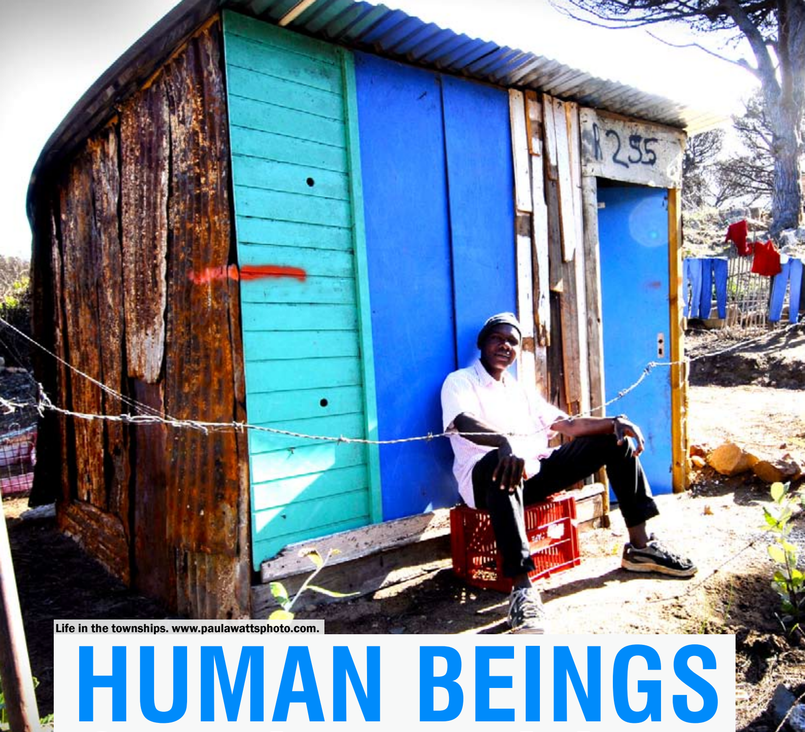
Life in the townships.